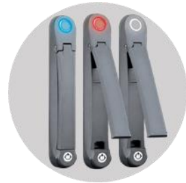
Led Indicators for door lock status